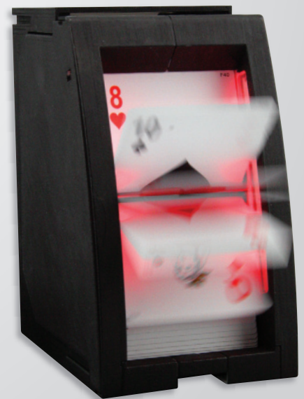
Large Unit in Motion