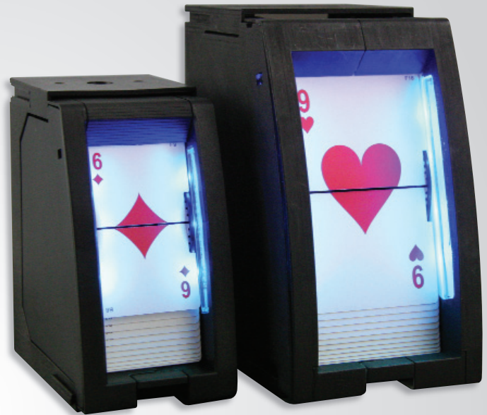
Small Unit (custom order only)